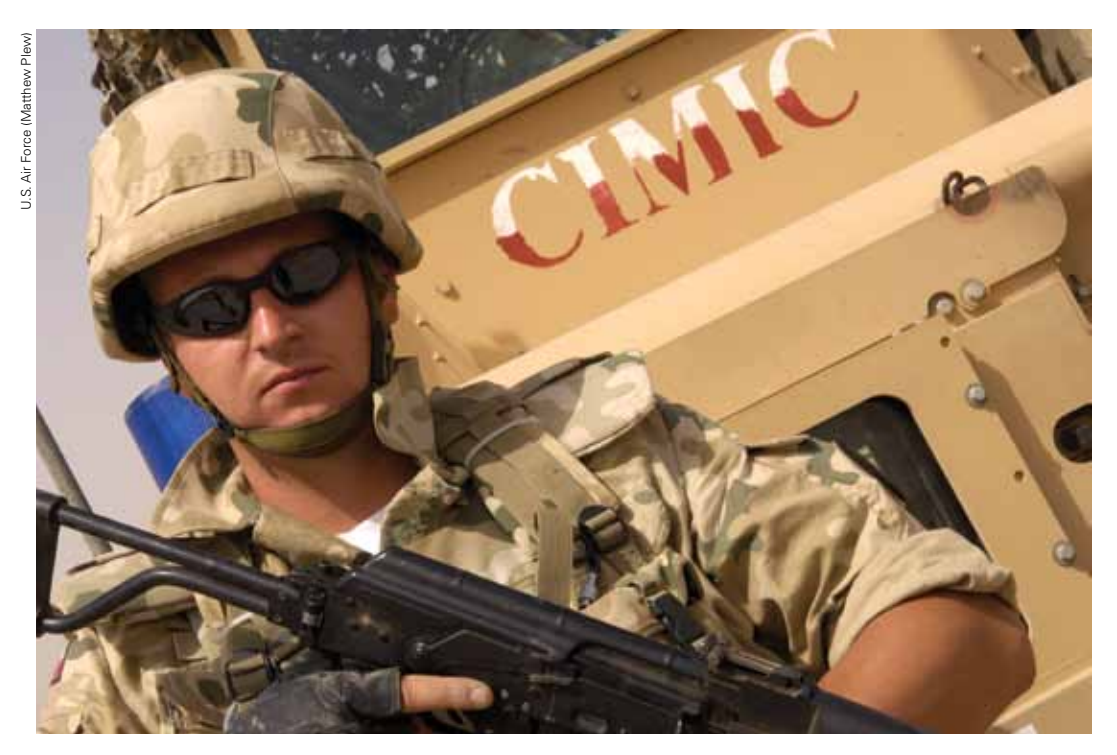
Polish soldier with CIMIC team inspects local projects in Ad Diwaniyah, Iraq, May 2008

While the concept generally calls for consistent integration across all echelons from the political to the tactical level, <sup>13</sup> its practical use as an effective tool is almost exclusively limited to the tactical, and in the operational-level